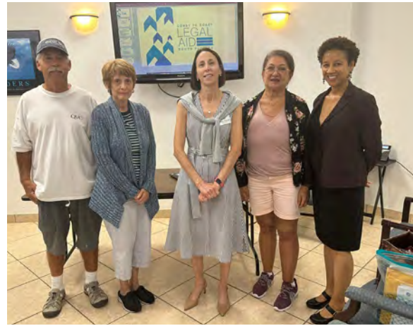
Presentation to Seniors on Preventing Fraud