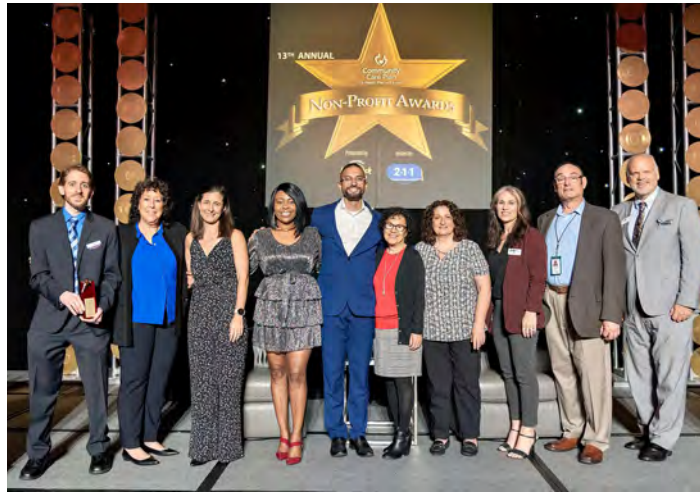
CCLA & GJFS honored with 211 Broward Nonprofit Award for Collaboration