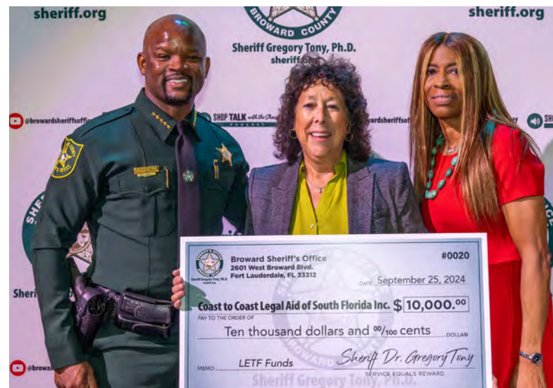
CCLA awarded LETF Grant from the Broward Sheriff's Office