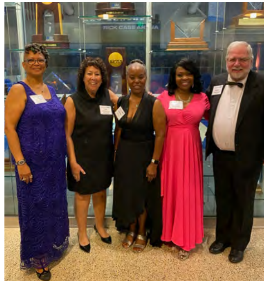
Nova Southeastern University's School of Law's 50th Anniversary Celebration