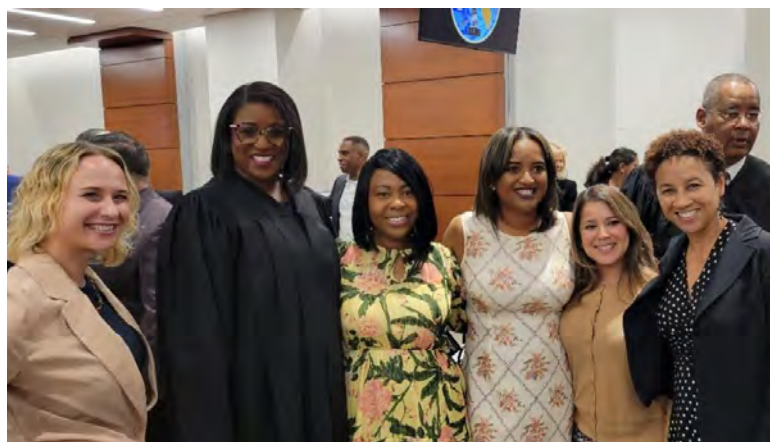
2024's 17th Judicial Circuit, BCBA, & TJ Reddick Bar Association's Black History Month: A Celebration of our Black Judges