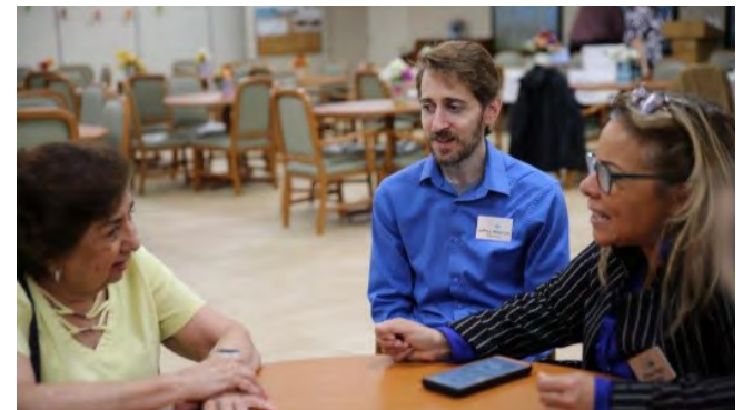
Advance Directives Clinic for Seniors