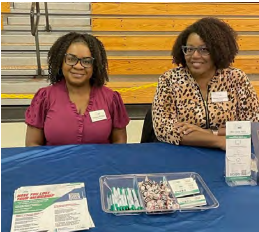
Broward Co. School Social Work Resource Fair