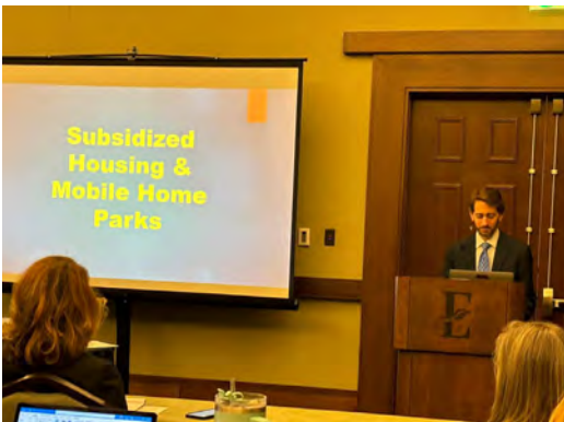
Presenting at a Statewide Disaster Conference about Housing