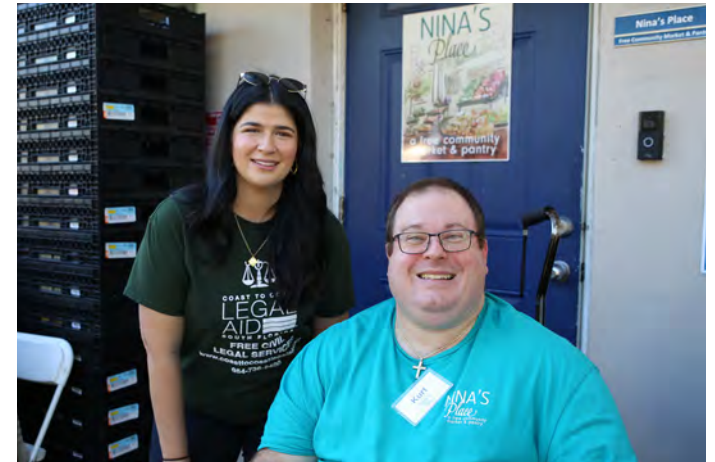
Nina's Place with Deerfield Community Cares