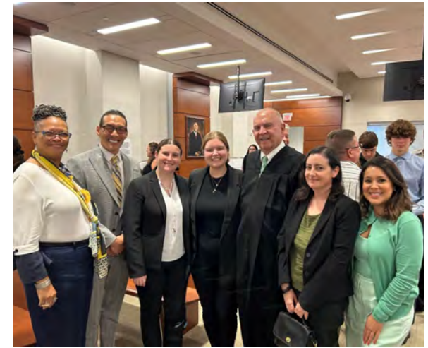
CCLA with Chief Judge Jack Tuter at Investitures