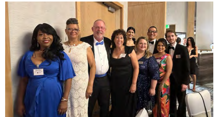
Broward County Bar Association Gala