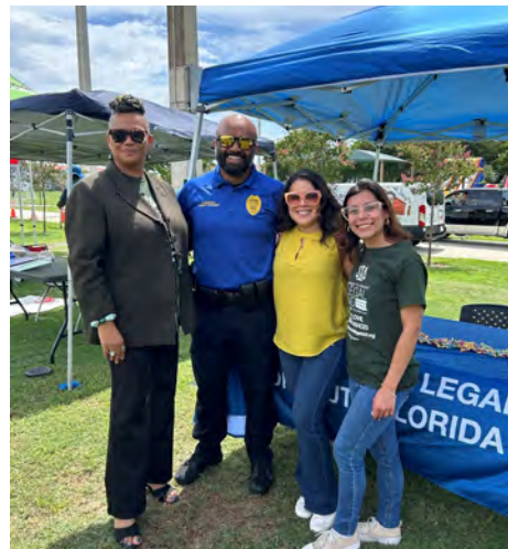
National Night Out in Plantation