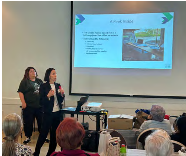
Outreach Presentation to Seniors