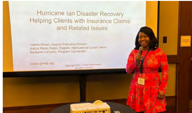
Hurricane Ian Disaster Recovery Panel