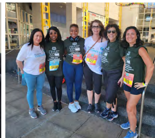
CCLA in 2024's Lexus Corporate 5k Run/Walk