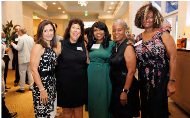
CCLA Staff at 202 For Public Good Event