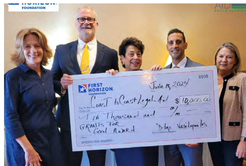
CCLA awarded a First Horizon Foundation Grant for Good