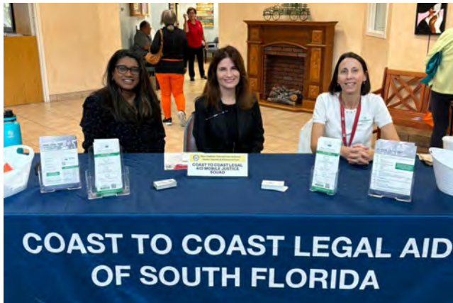
Outreach at Senior Focal Point