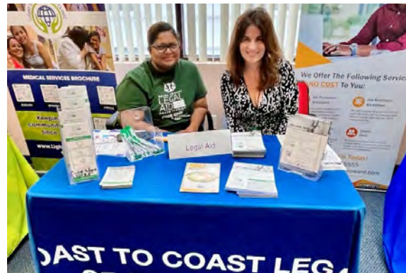
Outreach table at Henderson Mental Health Event