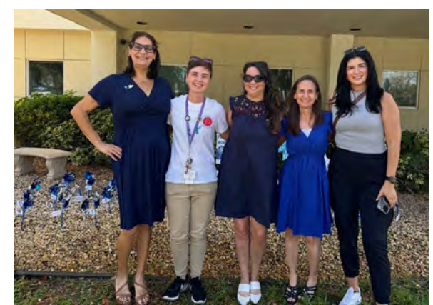
Broward Aware Child Abuse Prevention Event