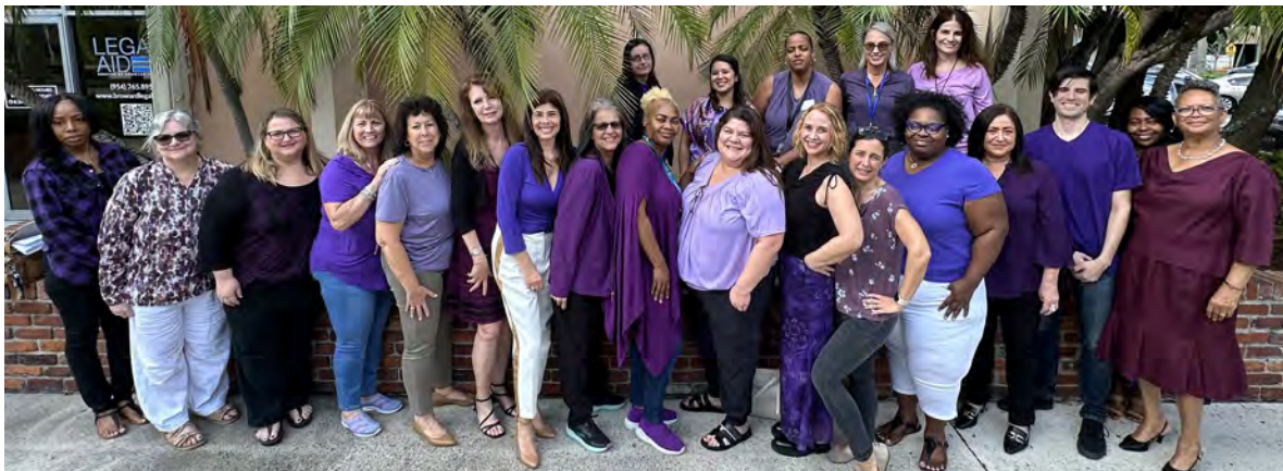
Wearing Purple for Domestic Violence Awareness Month