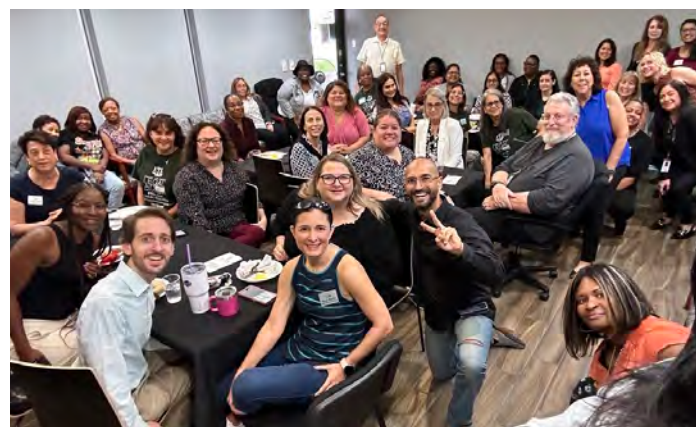
Board Meet and Greet Breakfast