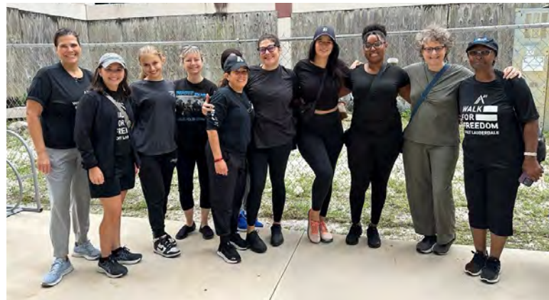
Human Trafficking A21 Walk for Freedom