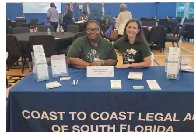
City of Fort Lauderdale's Live Well, Leave a Legacy Event www.CoastToCoastLegalAid.org | 23