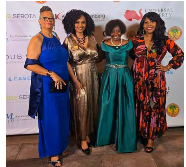
Caribbean Bar Association's Gala