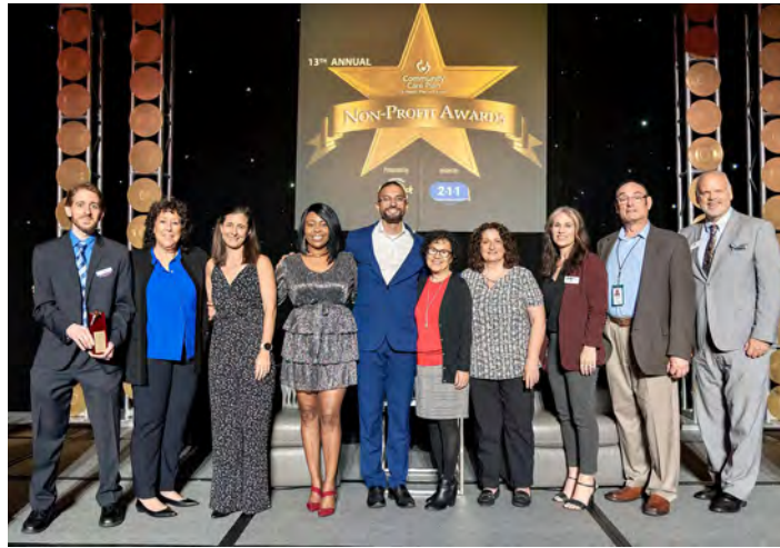
CCLA & GJFS honored with 211 Broward Nonprofit Award for Collaboration