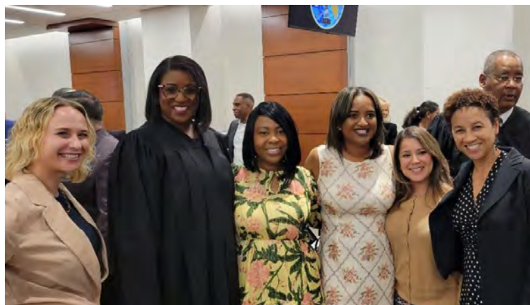
2024's 17th Judicial Circuit, BCBA, & TJ Reddick Bar Association's Black History Month: A Celebration of our Black Judges