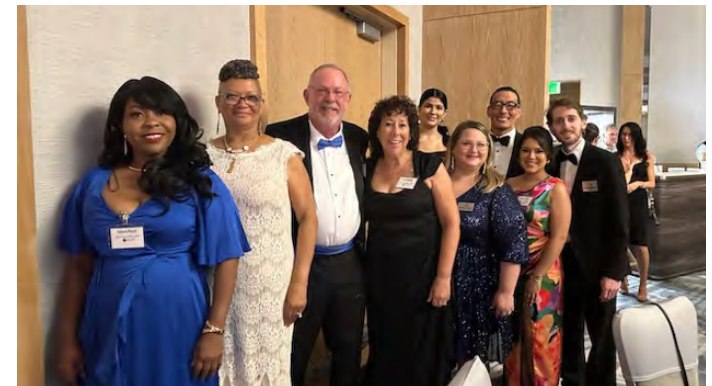
Broward County Bar Association Gala