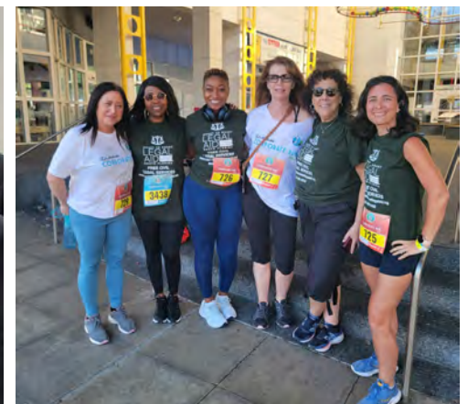
CCLA in 2024's Lexus Corporate 5k Run/Walk